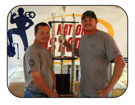
Gas House Gorillas City Utilities of Springfield