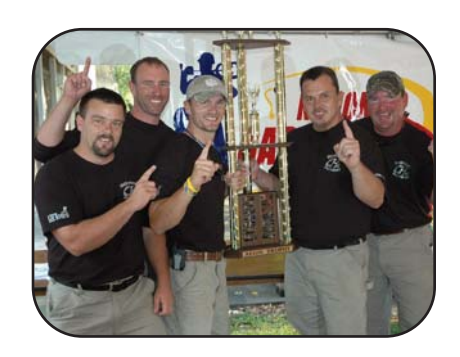
Insane Methane Piedmont Natural Gas