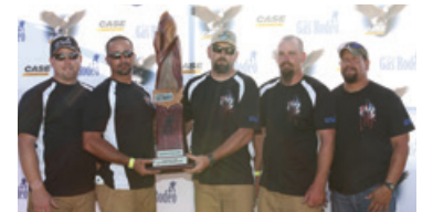
Explosive Limit Colorado Springs Utilities