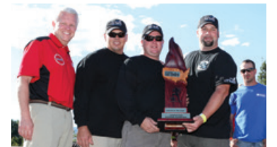
Insane Methane Piedmont Natural Gas